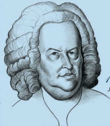
18th Century Johann Sebastian Bach

Where there were three separate "voices", now there is a concert.