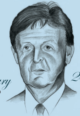
20th Century Paul McCartney

Tech Services, User Services, and OPAC Wikis were opened to enhance communication between the libraries during the Symphony transition